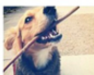
Town and Country's Dog of the Week