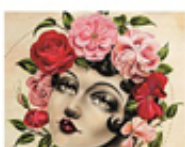
bazaar weekend guide: 27 - 29 june