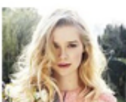
How To Be An English Rose