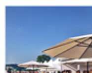
bazaar weekend guide: 4 - 6 july