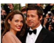
brad pitt and angelina jolie are married