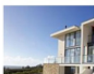
Luxury Property: Beach Houses